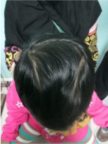
Fig. 4. Patient's head 6 months following the cranioplasty showing good skull contour without complications.