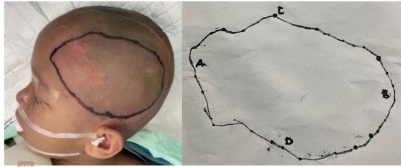
19 Fig. 2. The marked skull defect on the left side of the patient's head (left) and the guide for bone harvest on the normal calvaria, with points for reference; A: frontal, B: occipital, C: parietal, and D: temporobasal (right).