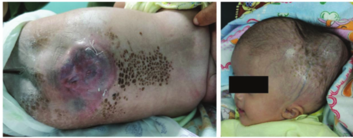
Figure 1. Clinical presentation of the neglected myelomeningocele (left) and enlargement of the head associated with cystic mass on parieto-occipital region (right).