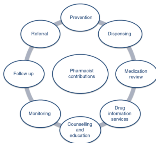
Figure 2: Pharmacist contributions in Southeast Asia.