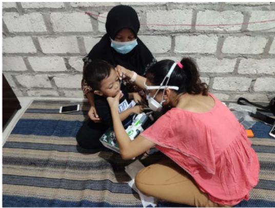
Fig. 1. The direct anthropometry by using caliper was performed in children, with the help of parents and toys.

standard deviation, and mean difference. Comparative analyses between the two methods (direct measurement and 3D) were performed using a Bland–Altman plot and