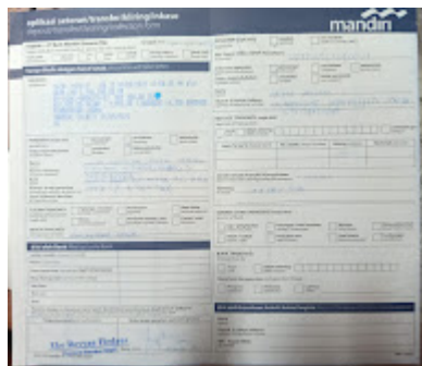
PAYMENT OF AJID APC.jpeg 235K

On Fri, May 20, 2022 at 6:42 PM ATHMSI EDITOR <athmsi2012@gmail.com> wrote: [Quoted text hidden]