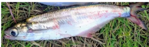
Figure 3. Lrides hexanema . First record for Brantas River, East Java, Indonesia (Stations 3 and 4)