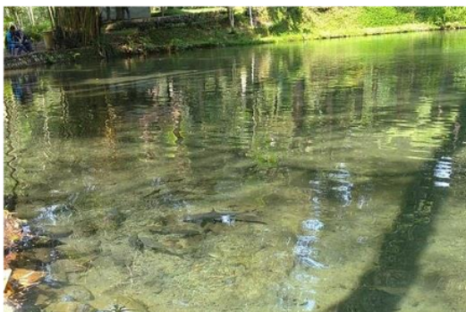
Figure 5. Mahseers ( Neolissochilus and Tor ) schooling in the spring of Brantas River, East Java, Indonesia (station 1)