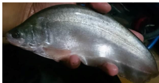
Figure 4. Notopterus notopterus . A protected species from Brantas River, East Java, Indonesia (Stations 2, 3, and 4)