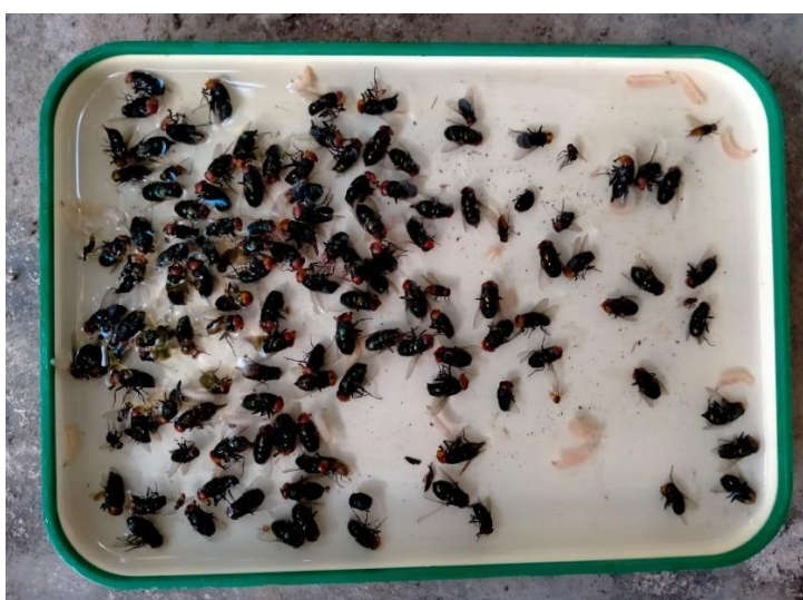
Figure 1. Flies caught with bait in a fly trap.