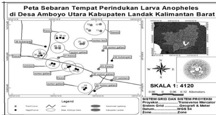
Figure 2. Map of Distribution of Breeding Places in Area with High Malaria Cases in North Amboyo Village, Ngabang Subdistrict, Landak Regency, 2018

mapping of breeding places distribution according to breeding places showed p=0.001 which meant that the clustering was significant. When there were cases of malaria near the cluster, there would be an increase in risk of malaria transmission in that cluster area.