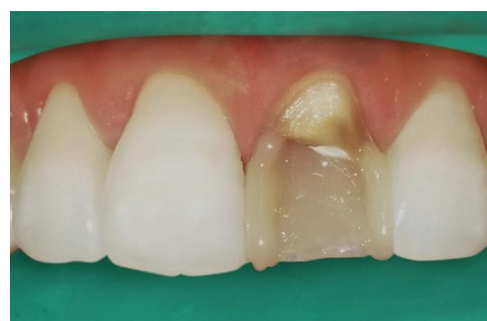
Figure 4. Proximal walls.