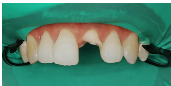
Figure 2. Isolation and direct pulp capping.

The second phase was to build the proximal walls (Figure 4). The proximal walls needed to be splinted to adjacent teeth (tooth 11 and 22) and built according to proper