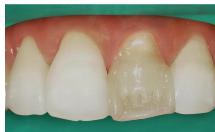
Figure 5. Dentin body, mamelons, and incisal halo.