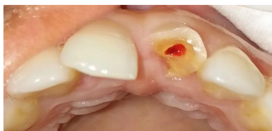
Figure 1. Pre-operative clinical picture.

Due to lack of remaining sound coronal tooth structure for adequate ferrule effect, surgical extrusion needed to be performed prior to root canal treatment and restoration in order to reestablish a ferrule effect. 4,8 Therefore, surgical extrusion, root canal treatment followed with endodontic post, core build-up, and porcelain crown was proposed to restore the morphology, function, and esthetics of the fractured maxillary left central incisor. Nevertheless, due to financial and time constraint, patient refused the suggested treatment plan. Hence, an alternative treatment plan which suited the financial capability and time availability of the patient needed to be addressed. Therefore, pulp capping followed by direct resin composite bridge was proposed as the alternative treatment. Direct resin composite bridge takes only one appointment to deliver and costs only a fraction than the conventional treatment. 5,7 The patient agreed the alternative treatment plan of direct resin composite bridge.