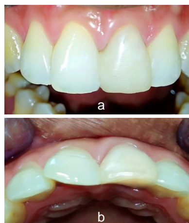
Figure 8. Direct resin composite bridge five years follow up a) Labial view; b) Incisal view.