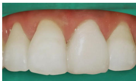
Figure 6. Labial layer.

Conventional treatment for enamel-dentin-pulp fracture leaving little sound tooth structure like in this case report comprises of reestablishing ferrule effect, endodontic