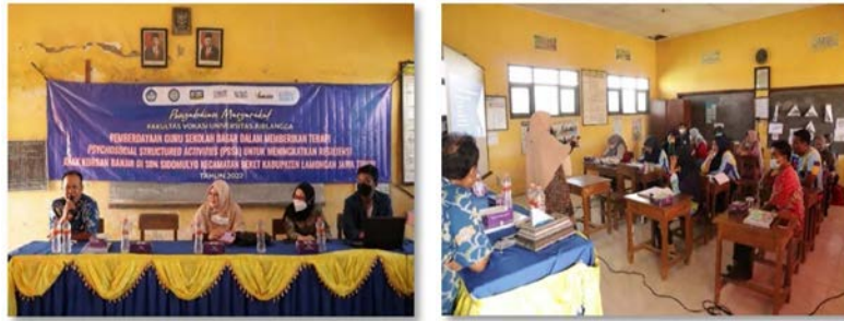
Figure 2. Health education by keynotes speaker

Before continuing the practicum, the community service team and the training participants did ice-breaking . This ice-breaking is given on the sidelines of the training to eliminate boredom, raise enthusiasm, and increase participants' attention and concentration (Marzatifa et al., 2021). Furthermore, the community service team conducted demonstrations and simulations on Psychosocial Structured Activities (PSSA) in small groups. The tool used is the Psychosocial Structured Activities kit . All trainees were enthusiastic while doing the Psychosocial Structured Activities practicum (Figure 3).