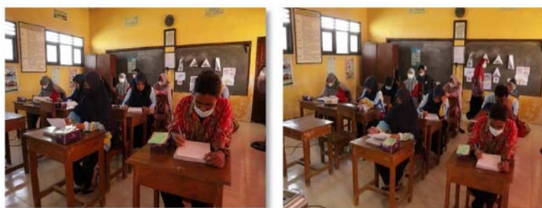
Figure 5. Pre-test and post-test evaluation process

The third stage is the evaluation and follow-up plan. The community service team provides an evaluation in the form of a pre-test to measure the level of initial knowledge and a post-test to determine the success of participants' understanding of both theory and practicum about psychosocial support and Psychosocial Structured Activities (PSSA), both knowledge and skills (Figure 5).