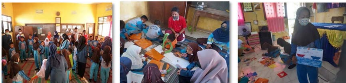
Figure 4. Psychosocial Structured Activities (PSSA) assistance

The second stage is the assistance of the community service team to assist elementary school teachers in carrying out Psychosocial Structured Activities (PSSA) for elementary students, including PSSA in phase 1 (safety), phase 2 (self-respect), phase 3 (personal narrative), phase 4 (adjustment), and phase 5 (future planning). The target of this PSSA in elementary school students from grades 1 to 6, led and facilitated by training participants, namely teachers. The training participants were enthusiastic when leading PSSA, and students from grades 1 to 6 were very enthusiastic, happy, and actively following the directions of the training participants' teachers (Figure 4).