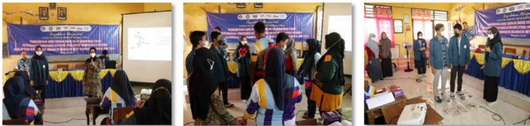
Figure 3. Demonstration and simulation Psychosocial Structured Activities (PSSA)

Before continuing the practicum, the community service team and the training participants did ice-breaking . This ice-breaking is given on the sidelines of the training to eliminate boredom, raise enthusiasm, and increase participants' attention and concentration (Marzatifa et al., 2021). Furthermore, the community service team conducted demonstrations and simulations on Psychosocial Structured Activities (PSSA) in small groups. The tool used is the Psychosocial Structured Activities kit . All trainees were enthusiastic while doing the Psychosocial Structured Activities practicum (Figure 3).