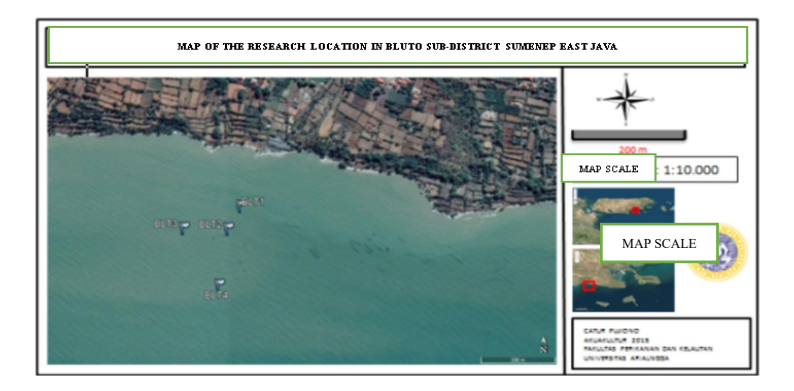
Figure 1. Map of the research location in Bluto sea waters. Note :

Blt1: -7,125284 east longitude and 113,780033 south latitude (cultivation area)Blt2: -7,125827 east longitude and 113,779728 south latitude (cultivation area)Blt3: -7,125815 east longitude and 113,778647 south latitude (cultivation area)Blt4: -7,125815 east longitude and 113,778647 south latitude (cultivation area)