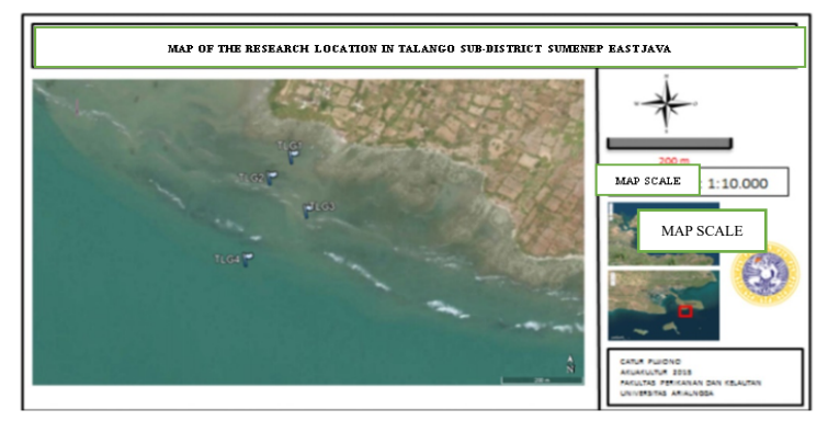
Figure 2. Map of the research location in Talango sea waters. Note:

Blt4 : -7,127187 east longitude and 113,779507 south latitude (cultivation area)