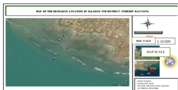
Figure 2. Map of the research location in Talango sea waters.