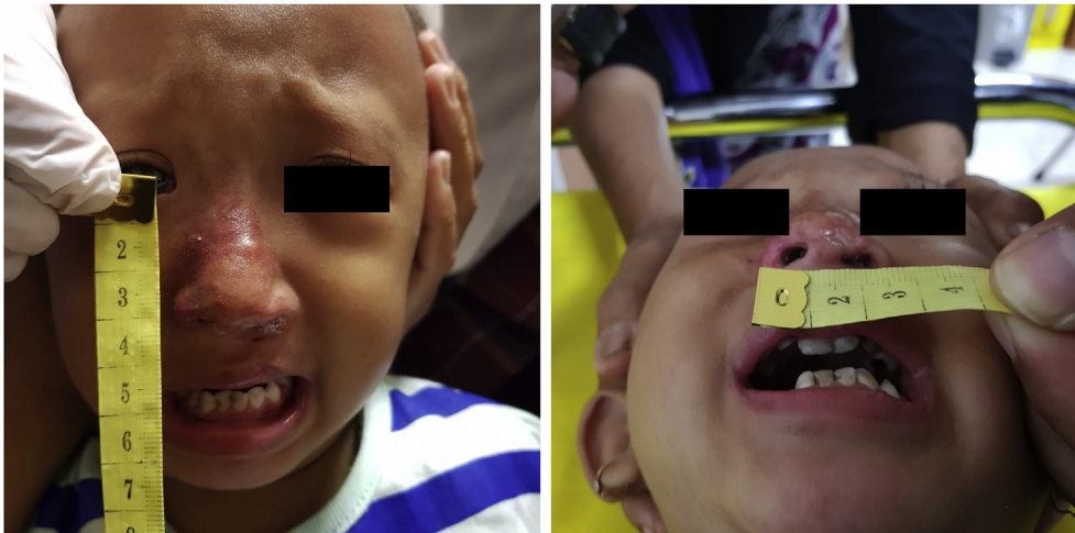
Fig. 3. Post-palatoplasty and nasorraphy, after taking propranolol for one year.

with changing techniques, surgery can be the first-choice therapy, especially in the location of lesions with significant cosmetic or functional defects [16]. Unfortunately, after we gave a choice for surgery or conservative therapy, the parents of the patient preferred conservative treatment.