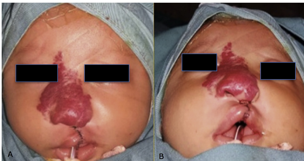
Fig. 2. Post-labioplasty, after taking propranolol for one month.

Until now, hemangioma management is still controversial. Traditionally, observation has been a therapeutic option in the hope that the lesions disappear spontaneously. This choice arises when surgical excision or other therapies may worsen the condition. However,