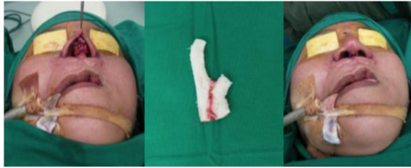
Fig. 2. Open rhinoplasty approach (left), 6th costal cartilage graft (center), post-op result (Right).