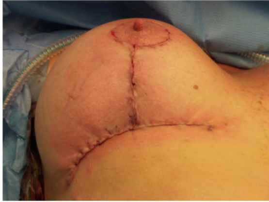
Fig. 3. The inframammary wound was closed by running intracutaneous sutures.

include lengthening of wound, complicated by skin necrosis, and involving additional scarring.