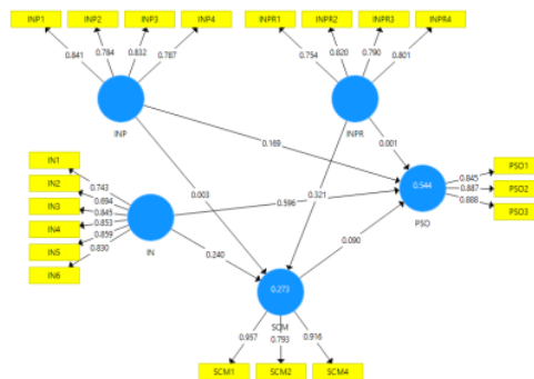
Figure 2. Measurement model assessment

The path analysis show that innovation and innovation process have positive association with public sector organization and accept H1 and H2. However, innovation performance has insignificant linked with public sector organization and reject H3. In addition, supply chain management has positive mediating among the links of innovation and public sector organization and accept H4. Moreover, supply chain management has positive