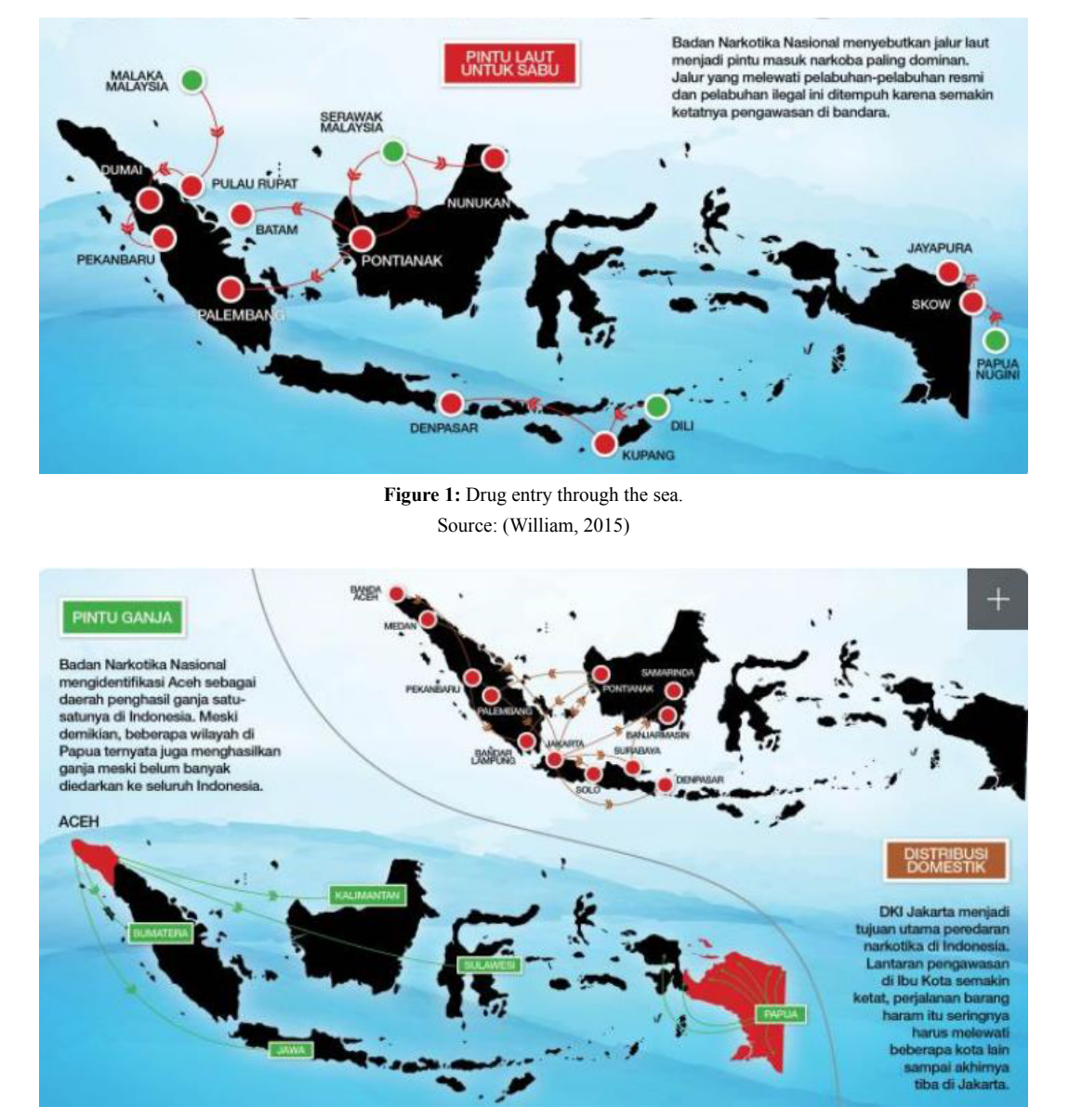
Figure 2: Drug trafficking in the country.

Aceh is listed by the National Narcotics Agency as the only cannabis growing area in Indonesia. Several areas in Papua, however, still cultivate cannabis, although it has not been widely distributed all over Indonesia. DKI Jakarta is Indonesia's primary destination for narcotics traffic. DKI Jakarta is still the principal drug marketing