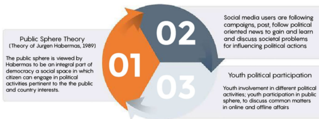
Fig. 3 Theoretical framework.

(Velasquez and LaRose 2015). There are more relevant studies claimed that social media apps were quite popular in 2008 campaign organised for elections, to share information, exchanged political news, and to express support for the candidates (Smith and Rainie 2008). Additionally, social media apps are the factors that influence people to interact and participate in politics, hence, social media is a major role to increase the political efficacy of followers.