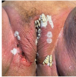
Figure 3. The current therapeutic procedure was performed with a combination of hefyrycauter and 90% TCA of the lesion