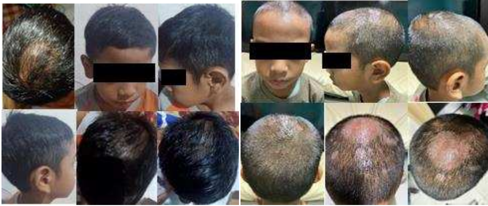
Figure 1. (a) Before treatment, (b) After treatment