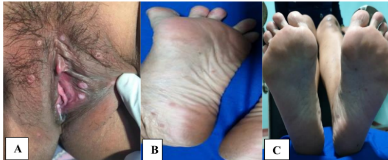
Figure 1. A. Multiple flat-topped papules, well-demarcated, moist, whitish over labia mayora, labia minora. B and C. Multiple erythematous maculopapular, annular, well-demarcated covered with a thin scale on plantar pedis sinistra

Physical examination over the labia mayora et minora showed that there were multiple flat-topped papules well-demarcated, moist, whitish colored with the greyish white vaginal discharge homogenous, stick to the vaginal wall. In plantar pedis sinistra, there were multiple erythematous maculopapular, annular, well-demarcated covered with thin scale.