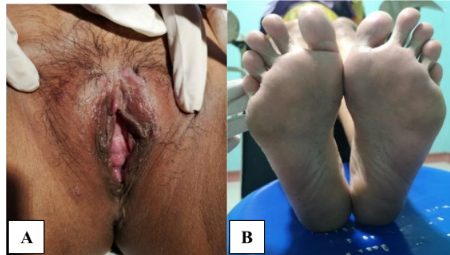
Figure 3. Improvement after 1 month treatment there is no condyloma lata and roseola Syphilitica.