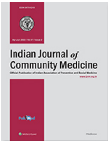
Table of Contents - Current issue

April-June 2022 Volume 47 | Issue 2 Page Nos. 157-308