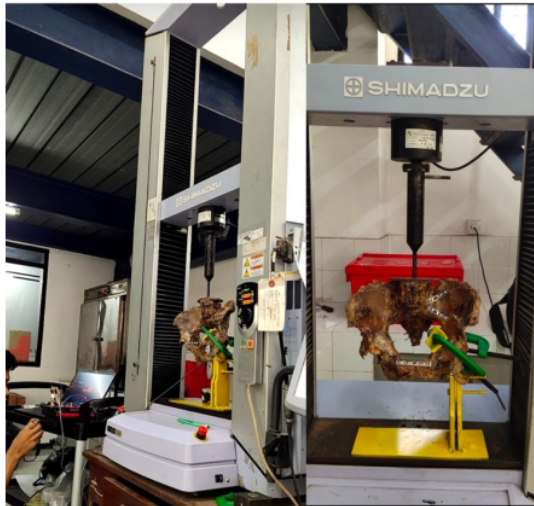
Figure 2. Biomechanical Testing of Cadaveric Pelvic Bone Using Autograf. A particular holder device was made to fix the pelvic during the experiment.