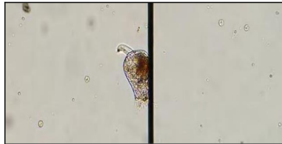
Figure 2. Brachionus spp (100X).

The growth of Brachionus spp. A population increase of Brachionus spp. was observed every day for 12 days. The results of the observations are presented in the form of densities of Brachionus spp. (Figure 2). The results of the ANOVA analysis are presented in Table 1. They show that different feeds significantly affected the population density of Brachionus spp. Each treatment had an influence on the growth of Brachionus spp.