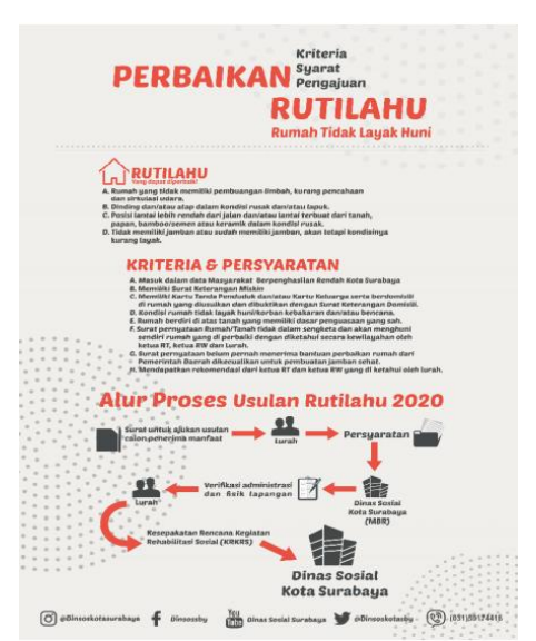
Figure 1. Application Flow for the Rutilahu Program

From the table, it can be seen that the quota and realization of the social rehabilitation program for uninhabitable houses is quite a lot every year. Over the past six years, the program's implementation has been quite good. It is seen from the percentage of realization that had always ranged from above 90% and even reached 100% in 2016. This shows the seriousness of the government in overcoming uninhabitable houses in Surabaya. On the other hand, the disposition of the implementor that is already good enough in the implementation of the program will have an impact on the behavior of the implementor when running the program in real terms in the field. So far, the implementor has implemented a social rehabilitation program for unfit for habitation in an optimal manner, and has even made a brochure that explains in detail the flow of submission to obtain the program so that the target group can understand it well as well.