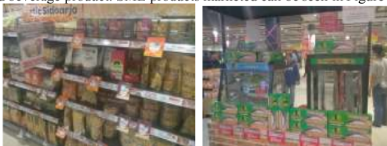
Fig. 2. SME products in X supermarket.

The type of superior product of the Sidoarjo Town which is marketed at X Supermarket is a food and beverage product. SME products marketed can be seen in Figure 2.