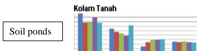
Figure 2. Overall Density of Cyanophyta (ind/l) in soil ponds (Time 14.00 WIB).

The highest total density of Cyanophyta was found in tarpaulin ponds of 6,152,000 ind / l and the lowest in soil ponds of 1,764,000 ind / l. The high density was due to Cyanophyta being able to grow optimally during that period. Moreover, in the tarpaulin ponds were fish that were cultivated, whereas in the ponds, there were no cultivated fish.