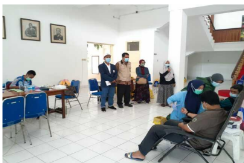
Figure 2. Screening for the convalescent plasma donors