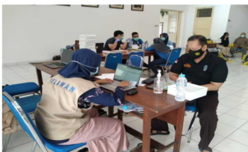
Figure 4. Data Collection for Covid-19 Survivors

Patient Family Assistance Volunteers as facilitators, and Covid-19 survivors especially the alumni of RSLI Surabaya as recipients of the program benefits. The target of this activity was the patient population of Covid-19 patients and survivors from RSLI Surabaya. Samples were taken from the population through the inclusion criteria of willing to participate in the