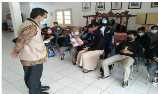
Figure 1. Education on the Benefits of Convalescent Plasma Donation