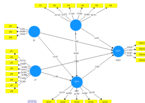
Figure 3. Structural model assessment