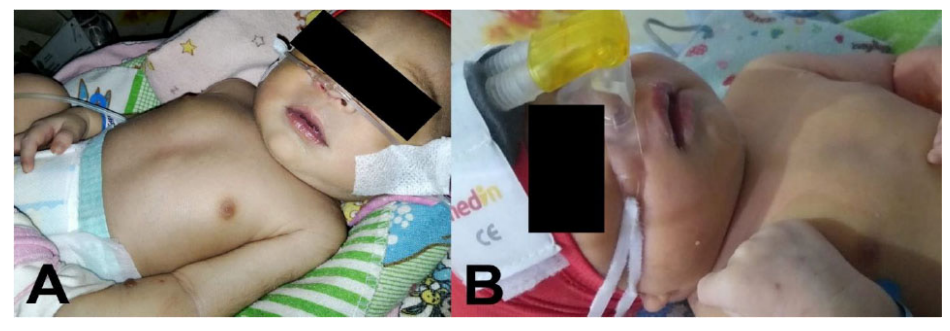
Figure 1. A and B. Scaphoid abdomen with subcostal and intercostal retractions.