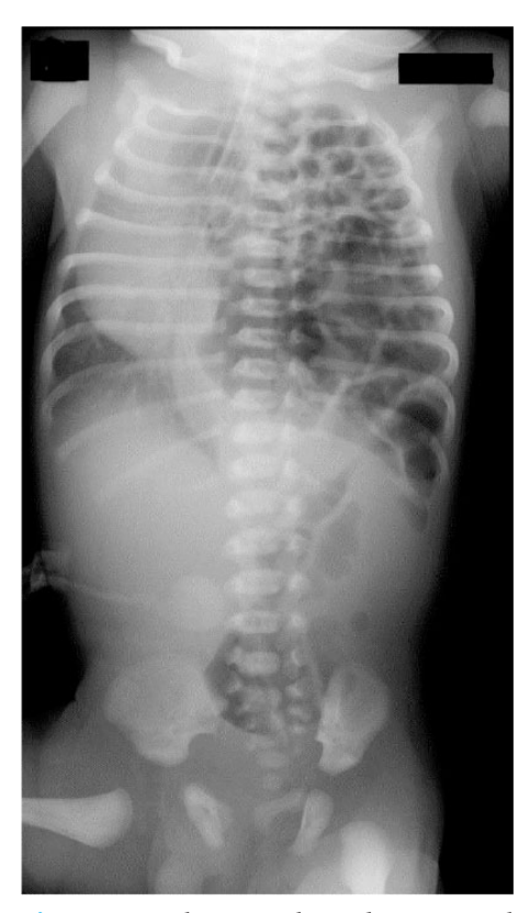
Figure 2.Babygram showed Congenital<br/>PulmonaryPulmonaryAirway<br/>Malformation (CPAM).

He suffered from respiratory distress with a respiratory rate of 80 breaths per minute, a heart rate of 160 beats per minute, and an oxygen saturation of 88% on room air. Subcostal and intercostal retractions, cyanotic extremities, and decreased breath sounds compared with bowel sounds on the left side of the chest were noted (Figure 1).