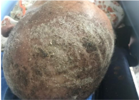
Figure 3. After 2 days treatment, lice on scalp were decreased and erosions still present.

This patient treated with systemic antibiotic ceftriaxone injection 1 gr 2 times daily, metronidazole drip 500 mg 3 times daily, PRC transfusion 2 kolf/day until HB more than 10g/dl permethrin 1 % (Peditox) apply to all over the scalp and hair, but secondary infection area not involved and after that cover it with bath