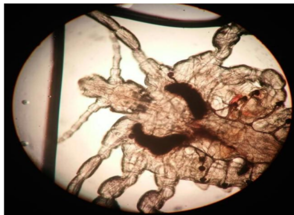
Figure 2. The scrapping examination showing scabiei mite, 100 times magnification.

when she admitted were within normal limit. Result from blood smear with anemia hypochromic microcytic. The scapping examination there were lice (Figure 2).