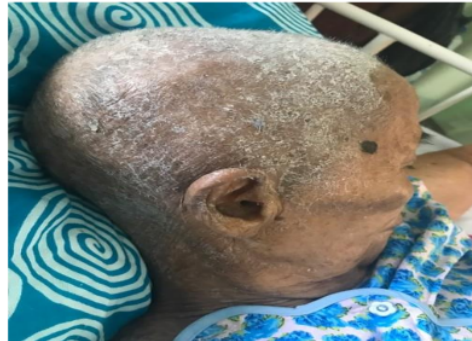
Figure 4. After 7 days treatment, no head lice and erosion got improvement.