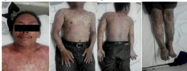
Figure 1. There were erythematous plaques sharply margined with thick scales on the elbows, knees, face, trunk, superior and inferior extremities symmetrically and erythematous macule sharply margined with white thin scale on the scalp.