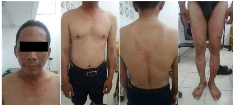
Figure 4. Ten days after antiretroviral therapy (ART) and desoximetasonone 0.25% cream were given, psoriasis vulgaris lesion showed improvement.