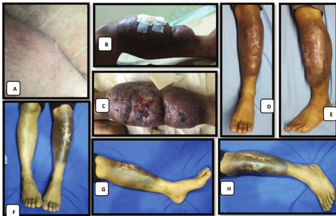
Figure 1. A. Single Asymptomatic Nodule As The First Appearance Of The Lesion (From Patient's Own Documentation); B. Large fluctuant Mass Measuring Approximately 20 X 15 X 5 Cm In Size; C. Ulceration On The Surface; D. & E. The Lesions At The End Of The First Month Of Treatment; F, G., & H. The Lesions At Sixth Month Of Treatment.

Subcutaneous phaeohyphomycosis is a rare fungal infection and is even rarer in immunocompetent individuals because it usually occurs in immunocompromised patients. 9,10 Some cases have been reported within immunocompetent patients without pathologic antecedents as observed in this case. It shows that immunocompromised