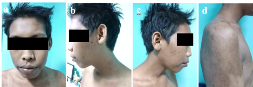
Fig. 4. (a-d) Facial puffiness dramatic improvement, the nodule was absent and there is only hyperpigmentation lesion on his face, neck, and limbs after 12 weeks treatment.

After the diagnosis was established, this patient was treated with itraconazole 400 mg daily with divided doses. We are followed up with this patient every week. Itraconazole therapy was received well by the patient and lesion resolution began after the first month of therapy. There was a dramatic improvement with a decrease in facial puffiness and decreased in size of bump in his face, neck, chest, arm, and back after 4 weeks of oral itraconazole 400 mg daily and complete resolution was reached after 12 weeks of treatment (Fig.4).