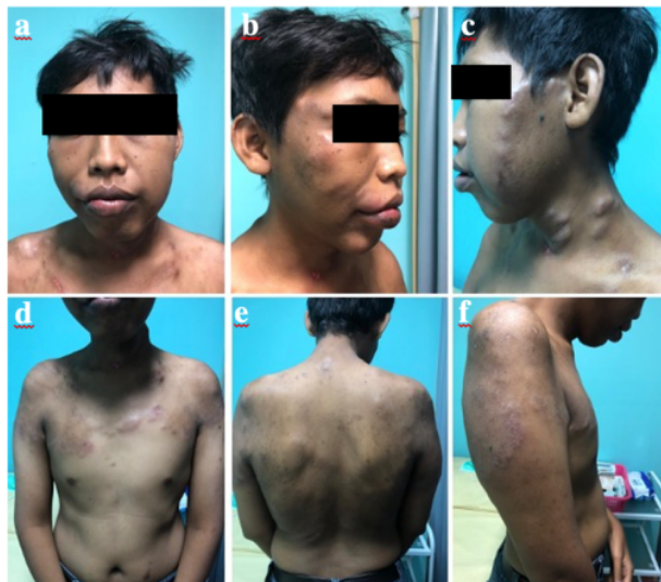
Fig 1. Clinical presentation of the patient (a), (b), and (c) Facial primarily affecting the midline of the face primarily involving both cheek, neck, upper and lower lip; (d) and (e) front and back chest; (f) right and left upper arm revealed multiple nodules, tenderness, mobile, and firm consistency

A 23 years-old man who worked as a carpenter in Kalimantan Forest, Indonesia for 5 years was consulted from the pulmonary department with progressive multiple painless bumps and swelling that appeared in his back in the last 2 years ago. The bump increase in size and spread to the chest, arms, and neck (Fig.1).