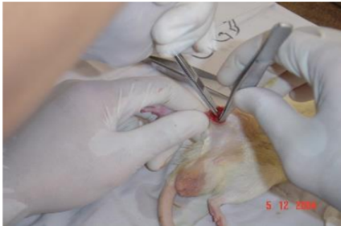
Figure 1. Fracture making process of the tibial bone of the rat

All thirty-six rats were stunned with an ether solution in a hood. Anesthesia was performed with a titration method. The anesthesia began 2 minutes after the rats closed their eyes and slowed their movements. Then, the factorization and immobilization of one side of its lower limbs were performed.