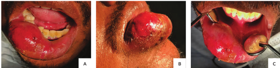
Figure 1. Lip lower abscess from anterior view (A), lateral view (B), the lower labial mucosa (C).

On further anamnesis, the patient slept on the floor every day. A few days before the swelling of his right lower lip, he felt that his lower lip was bitten by an insect while sleeping. When he woke up the following morning, his lips felt thick. Based on the history and results of the complete blood test, the diagnosis was a lip abscess caused by an insect sting. The treatment was continued, consisting of