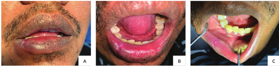
Figure 4. Vermilion of the lip (A-B) and mucosal (C) showed normal after treatment for 13 days.

that the insect may pick up an infectious organism such as a bacteria and passing them along when injecting the venom. 4 The second is a reaction to the remaining part of the sting as foreign material, resulting in a secondary bacteria infiltration. The third is the tendency of infection due to a damaged epidermis resulting from scratching of the sting site. 2 There are reports of septicemia occurring after insect stings, caused by pathogens entering the human body via the pores when stingers are left embedded in the skin. 4 In some research, the culture specimen from insect sting lesion revealed Staphylococcus aureus , Pseudomonas aeruginosa , Enterococcus faecalis , Xanthomonas maltophilia , and coagulase-negative Staphylococcus species. 10 An abscess may develop due to the presence of bacteria after an insect sting. 11