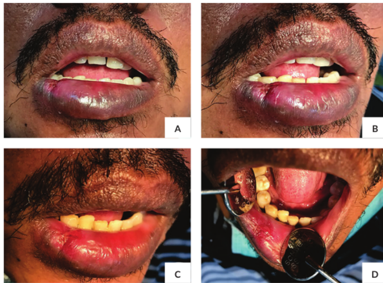
Figure 3. Lower lip dextral showed no abscess (A). the vermilion region showed ulceration after spontaneous drainage (B-C). The labial mucosa is normal (D).