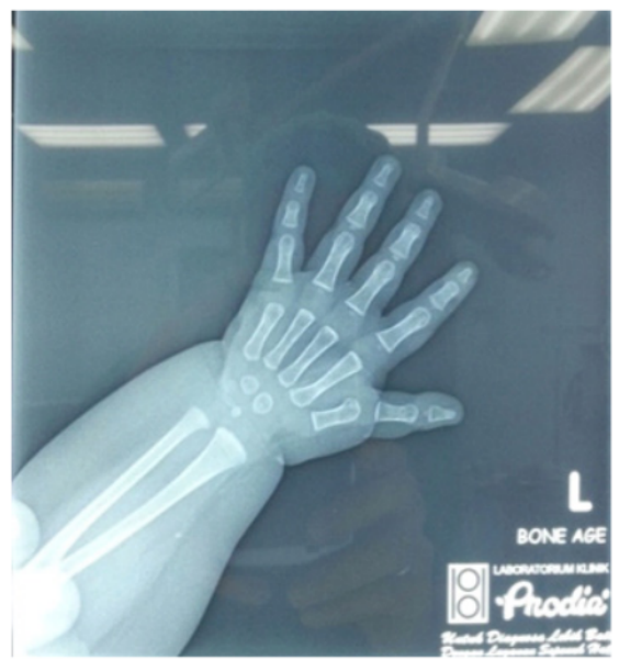
Figure 2. An x-ray revealed a bone age appropriate for a 14-month-old girl

The healthcare team and parents of newborns with ambiguous genitalia face an enormous challenge