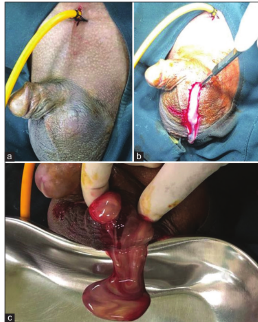
Figure 2: Cystostomy followed by abscess incision and drainage. (a) Cystostomy was done for suprapubic catheter placement. (b) Scrotal incision. (c) 150 ml of pus were drained

The goal of the treatment is aimed to prevent urinary sepsis by medical management using appropriate antibiotics