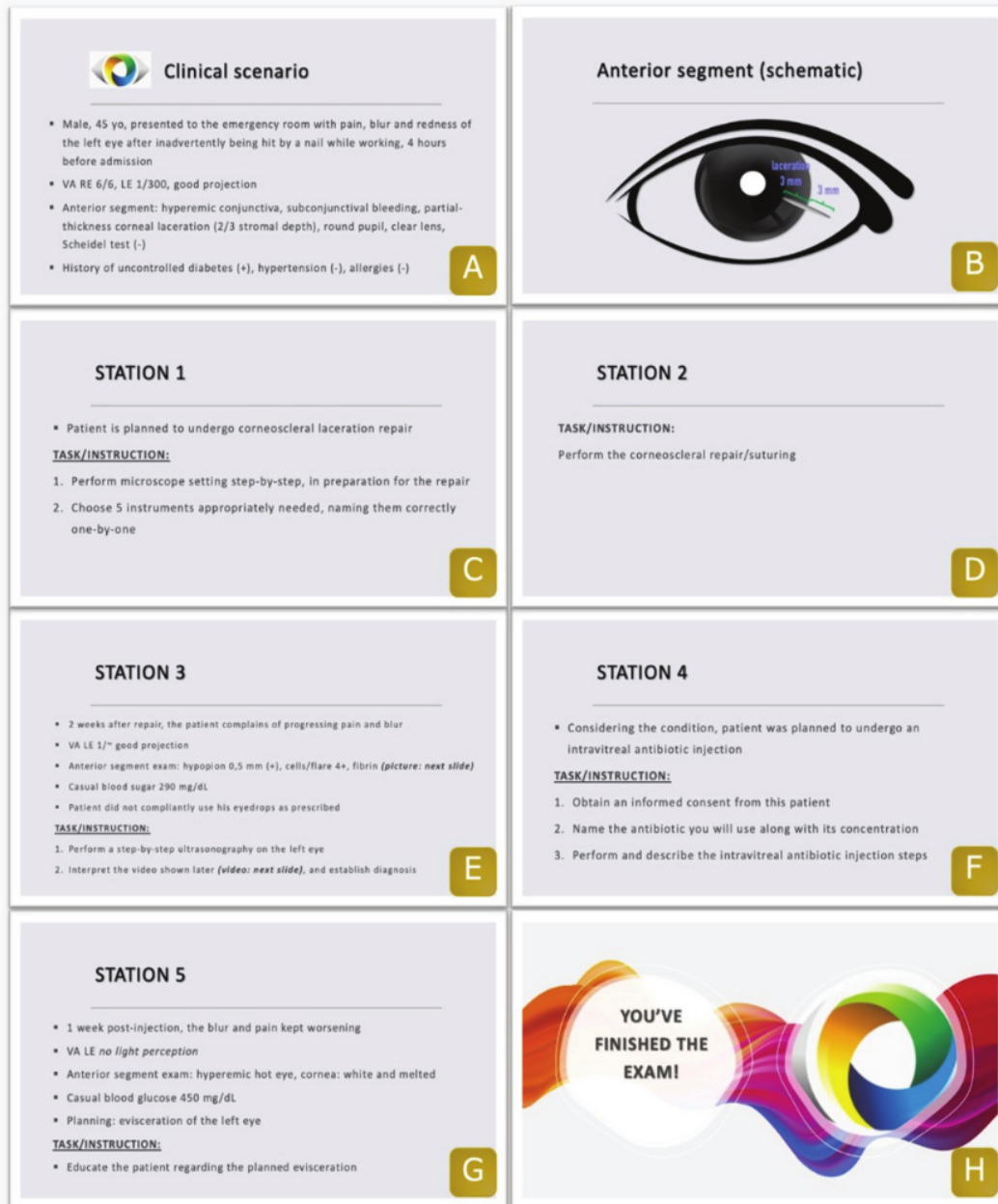
Fig. 3. An Example of Sequential Objective Structured Clinical Examination Station Slides Containing Tasks and Instructions

After confirming the identity of the candidate, the case scenario begins from (A) and finishes at (H), at a maximum of 60 minutes/examinee. (A, B) shows an introduction clinical scenario of a patient with corneolimbus scleral rupture. (C-F) With the clinical scenario dynamically changing, examinees are assessed on procedural skills either on an animal eye or standardized patient while simultaneously describing the steps one-by-one, and/or assessed on interpretation, diagnostic or management skills (i.e. antibiotic regimen decisions along with the intravitreal injection procedure). Animal eyes (wound structure) are always prepared fresh by local person in charge (PIC) who have been briefed through standardized briefed instructional videos. (G) Lastly, as the clinical scenario progressively worsens, the skill on patient education and delivering bad news is assessed with the central PIC as the standardized patient.