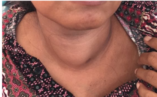
Figure 1. Swollen and painful left side of the neck of patient.

The patient was generally weak, but conscious (GCS 4-5-6), with blood pressure 110/70 mmHg, pulse of 92/minute, respiration rate of 20/minute, and axilla temperature of 38°C. Other physical findings revealed left anterior swelling of neck which was warm and tender, size 4–5 cm, moving up and down when swallowing, and painful (Figure 1).