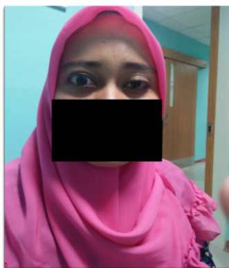
Figure 1. Clinical appearance of the patient during her first visit to endocrinology outpatient. Note the ptosis of left upper eyelid.