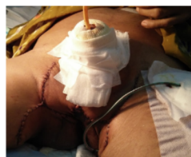
Figure 5. After skin graft procedure.

On the 35 th day of admission, the patient had undergone plastic procedure (closure of the defect with thick STSG (Split Thickness Skin Grafts) and bilateral pudendal perforator artery flap). After one week of the closure of the defect, the flap was in good condition: viable, warm, and the color was the same as the surrounding skin (Figure 5).