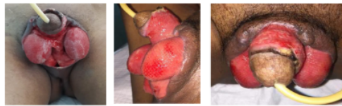
Figure 4. On third day of wound care

On the 4 th day of admission, the patient complained of surgical wound pain, and fever became better. Vital signs were within normal limit. The patient had a perianal drain and rectal tube, and wound condition showed in Figure 4 on the third day of wound care. The wound was in good condition, with no pus, and visible granulation tissue. Urine production was 1,500 ml/24 h. Laboratory finding: FPG 297 mg/dl; albumin 2.13 g/dl. The pus culture result: Staphylococcus aureus dan Klebsiella pneumoniae , resistance for ceftriaxone. The tissue culture result: Staphylococcus pasteurii . The patient was then given cefotaxime 1 gram/8 h based on sensitive culture result, basal insulin 10 unit subcutaneous injection once daily, and albumin transfusion.