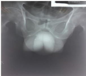
Figure 2. Pelvic x-ray showed gas formation in scrotal area.

Interdepartmental consultations, 1) Urology: the patient was diagnosed with Fournier's gangrene, suggested to perform necrotomy and debridement; 2) Digestive: the patient was diagnosed with perianal abscesses, the patient was planned to undergo an emergency incision and drainage procedure.