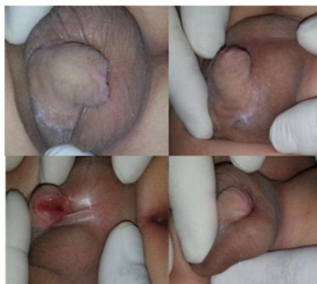
Fig. 1. The external genital of a 6 month old infant PA.

On external genital examination, the penis length was 2.8 cm in strength of penile length (normal 4.1 \pm 0.8 ). On palpability test, testes were palpable on the right and left of the scrotum. Right testicular volume was 1 mL and left testicular volume was 1 mL. When urinating, the flow of urine was not at the tip of the penis but lead down. External genitalia in infant PA was in accordance with Prader 4.