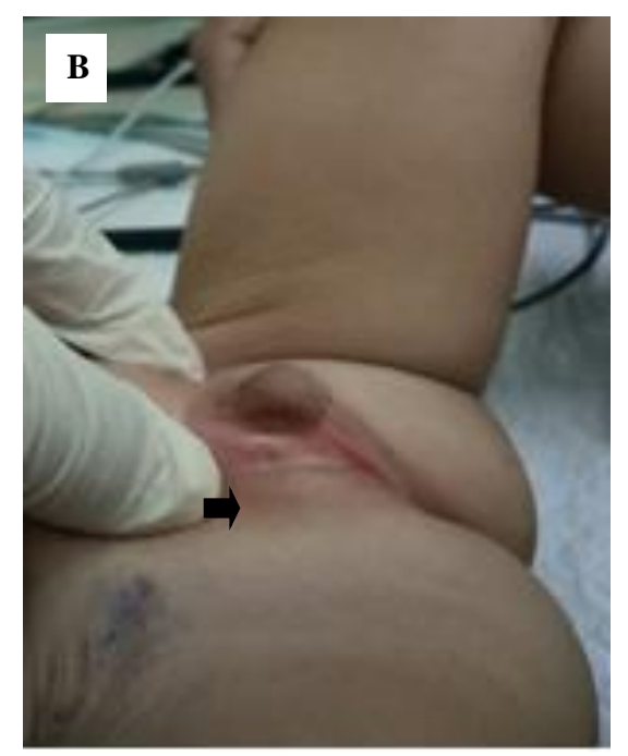
Figure 1. Picture of the 10-months-old patient with adrenal crisis (A) and congenital adrenal hyperplasia characterized by clitoromegaly (B)