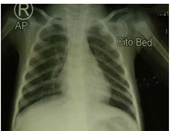
Figure 2. Normal chest x-ray

The patient was also planned for blood glucose and serum electrolyte monitoring and then was transported to PICU. She remained stable over the first night of admission. She was successfully weaned off from ventilator support on the third day of hospitalization. After the condition improved and extubated, the patient was switched to oral hydrocortisone 3 mg every 8 hours (15 mg/m²/day), fludrocortisone 0.1 mg every 24 hours orally, and a salt tablet. She was ultimately discharged on day 7 of admission in good condition. Currently, the patient was in stable condition and routinely controlled for pediatric endocrine OPC.