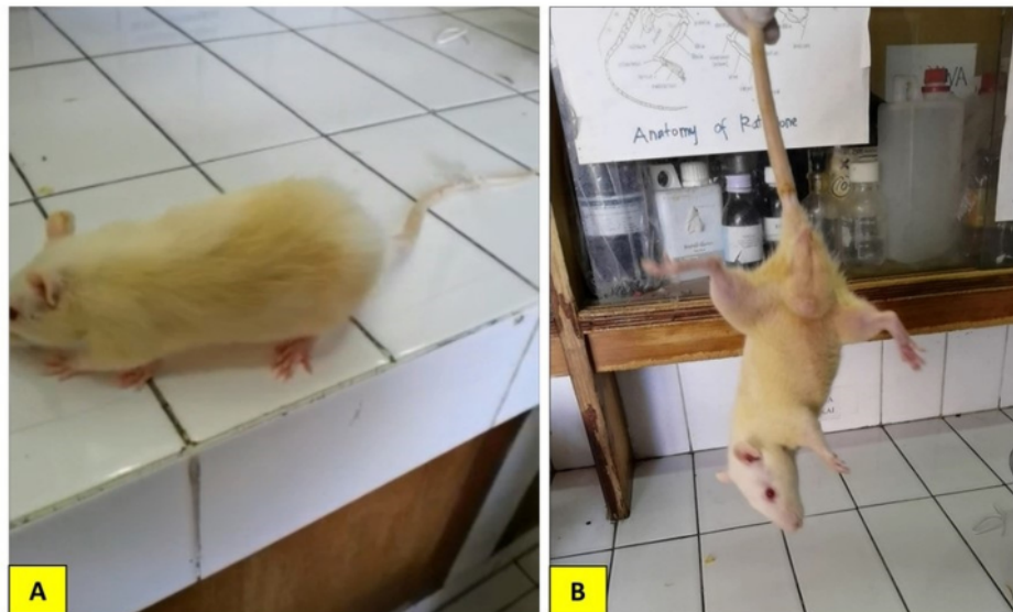
Fig. 2. Examination of mouse extremities muscle when (A) walking and (B) held at a height of 1 m.

The comparison of body weight among surviving mice is documented in Table 1. One mouse from the BACAS group that died had a body weight of 208 g,