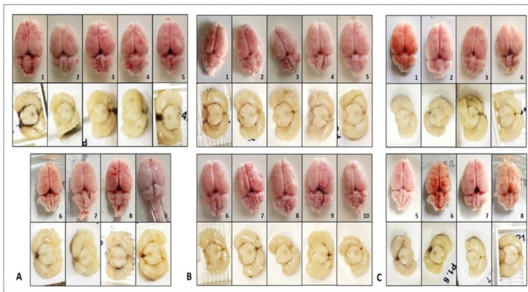
Fig. 3. Gross morphological evaluation of mice's brain in (A) Pre-experimental, (B) Sham-operated, and (C) BACAS group revealed no signs of infarction or hemorrhage.