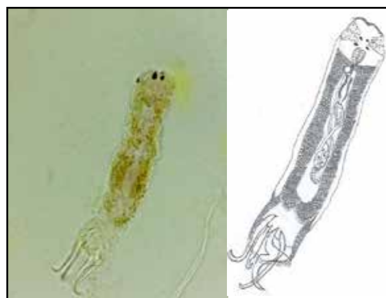
Fig 3. H. epinepheli adult (magnification 40x; bar scale 146 µm), with Semichoeh Carmine staining and H. epinepheli adult (bar scale 200 µm), drawing with Camera Lucida.