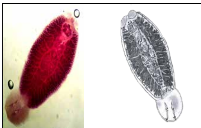
Fig 2. N. girellae adult (magnification 40x; bar scale 5,6 mm), With Semichoeh Carmine staining and N. girellae adult (bar scale 5,8 mm), drawing with Camera Lucida.

The poor water quality and infestation of trematodes of fishes reared in floating net cages and high density the red snappers in the net cages can cause adverse effect on the immune