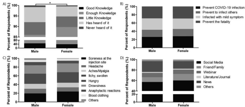
Figure 2. Self-claimed knowledge and understanding about the COVID-19 vaccine. (A) Self-claimed knowledge of the respondents, (B) benefits of COVID-19 vaccination, (C) side effect of the COVID-19 vaccine and (D) source of information about COVID-19 vaccination programs.