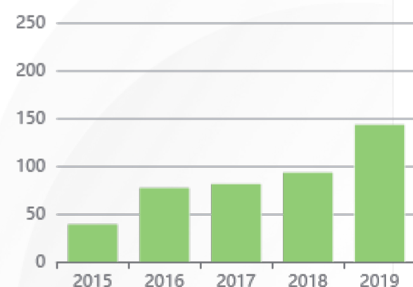
Journal By Google Scholar