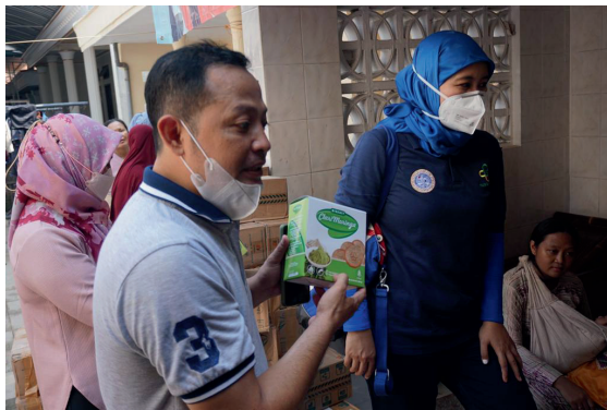
Figure 1. Dissemination of the benefits of Moringa biscuits.

The data collection was carried out three times. The evaluation was carried out once a month by measuring the weight, height, and condition of any infection in children after consuming moringa biscuits. Height and weight were measured using a microtome and a digital scale standardized by the Ministry of Health of the Republic of Indonesia. The data on weight and height were analyzed using