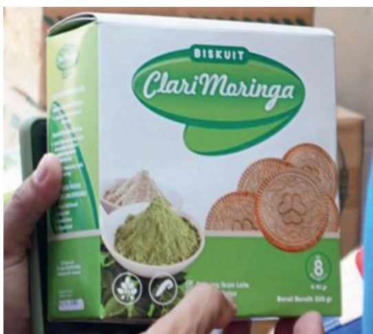
Figure 2. Moringa biscuits

univariate and multivariate tests on SPSS and presented in a graphical form.