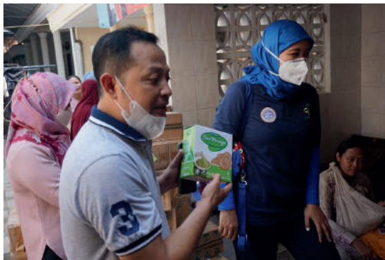
Figure 1. Dissemination of the benefits of Moringa biscuits.

The data collection was carried out three times. The evaluation was carried out once a month by measuring the weight, height, and condition of any infection in children after consuming moringa biscuits. Height and weight were measured using a microtome and a digital scale standardized by the Ministry of Health of the Republic of Indonesia. The data on weight and height were analyzed using