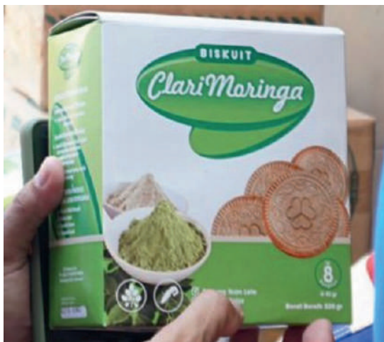
Figure 2. Moringa biscuits

univariate and multivariate tests on SPSS and presented in a graphical form.